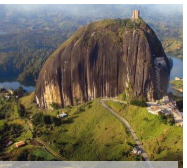
"El Peñon De Guatape Is The Most Epic Way To 'Take The Stairs'": The Huffington Post. 2014